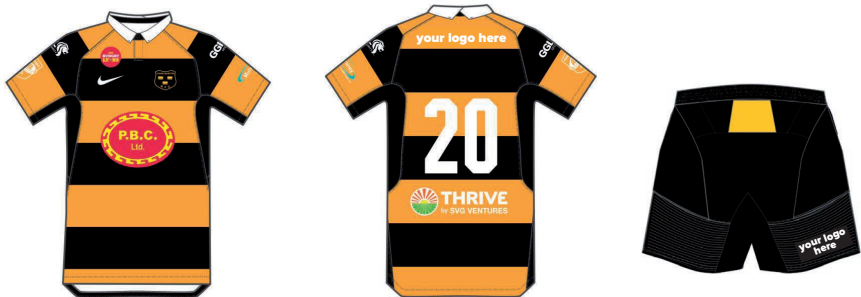
Example of various sponsorship options on jerseys and shorts for company logo on Young Munster Kit